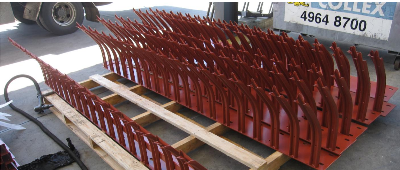
PALISADE INFINITY™ by BFH SYDCON during fabrication site inspection by VSL Infrastructure Protection Engineer