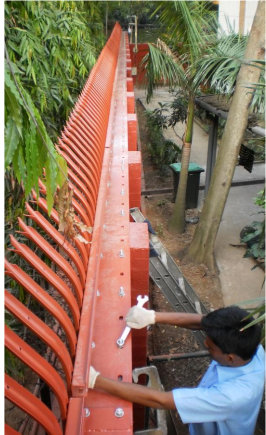
Installation PALISADE INFINITY™ fabricated by BFH SYDCON at the VSL Infrastructure Protection project site